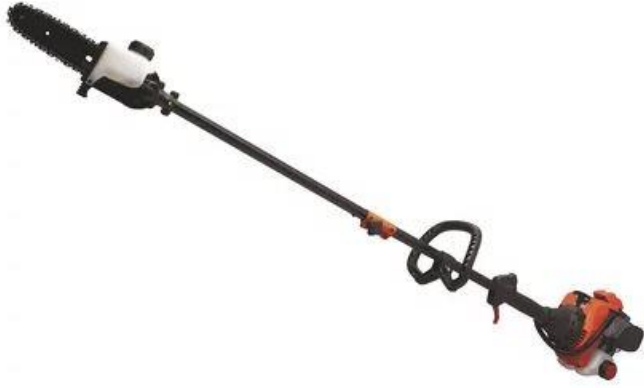
Recalled Remington Polesaw